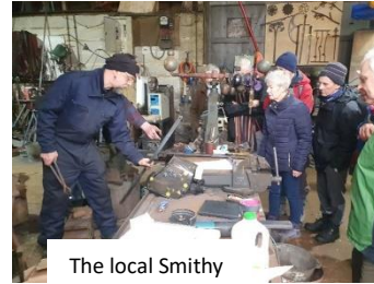
The local Smithy